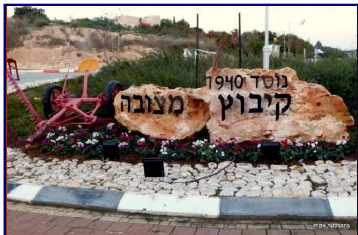
Welcome to Kibbutz Matzuva

Welcome to Kibbutz Matzuva Finally, and it's taken 75 years, you can now see a special sign on the first roundabout when you pass the automatic gate and the night watchman's hut.