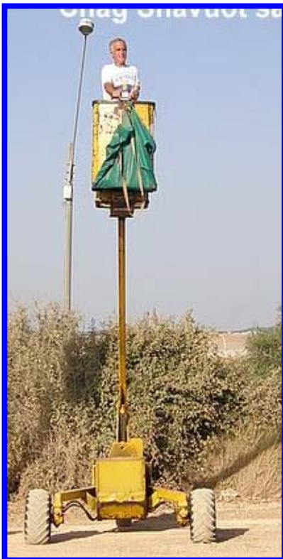
Nahum Niv and Lift on top of the world!